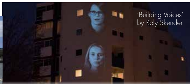
'Building Voices' by Roly Skender